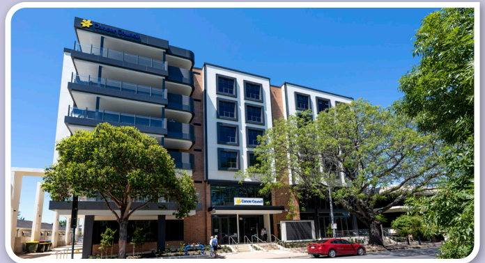
202 Greenhill Road, Eastwood

We are so grateful for each and every one of you who have made this possible. Thank you, once again, for creating a home for every South Australian impacted by cancer regardless of where they're from, or where they are in their cancer experience.